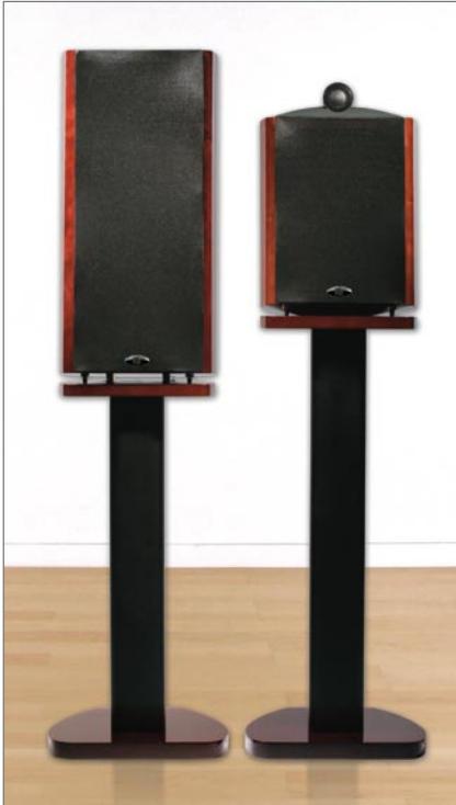
(stands sold separately)